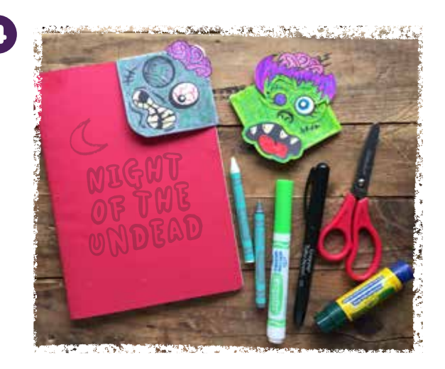
Just slip your bookmark on the corner of your page to mark your spot!