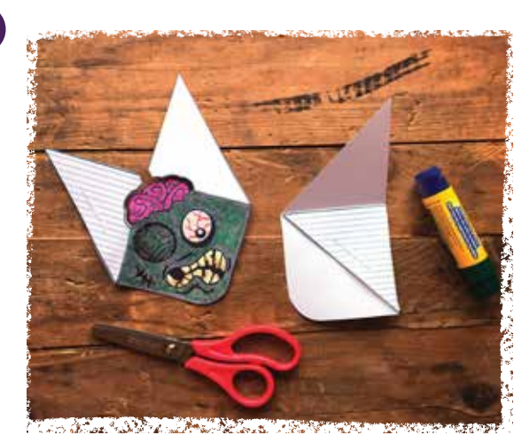
On the zombie head, starting at the dotted line, cut out along the brain outline. Then fold both bookmarks along the dotted line and glue them on the glue panel.