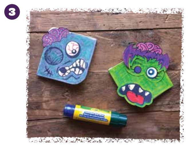
On the blank zombie head, glue on whatever eyes, mouth, hair, brains you want...or draw your own!